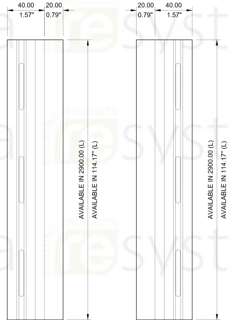
3 PLAN DC-1 SCALE 1:2