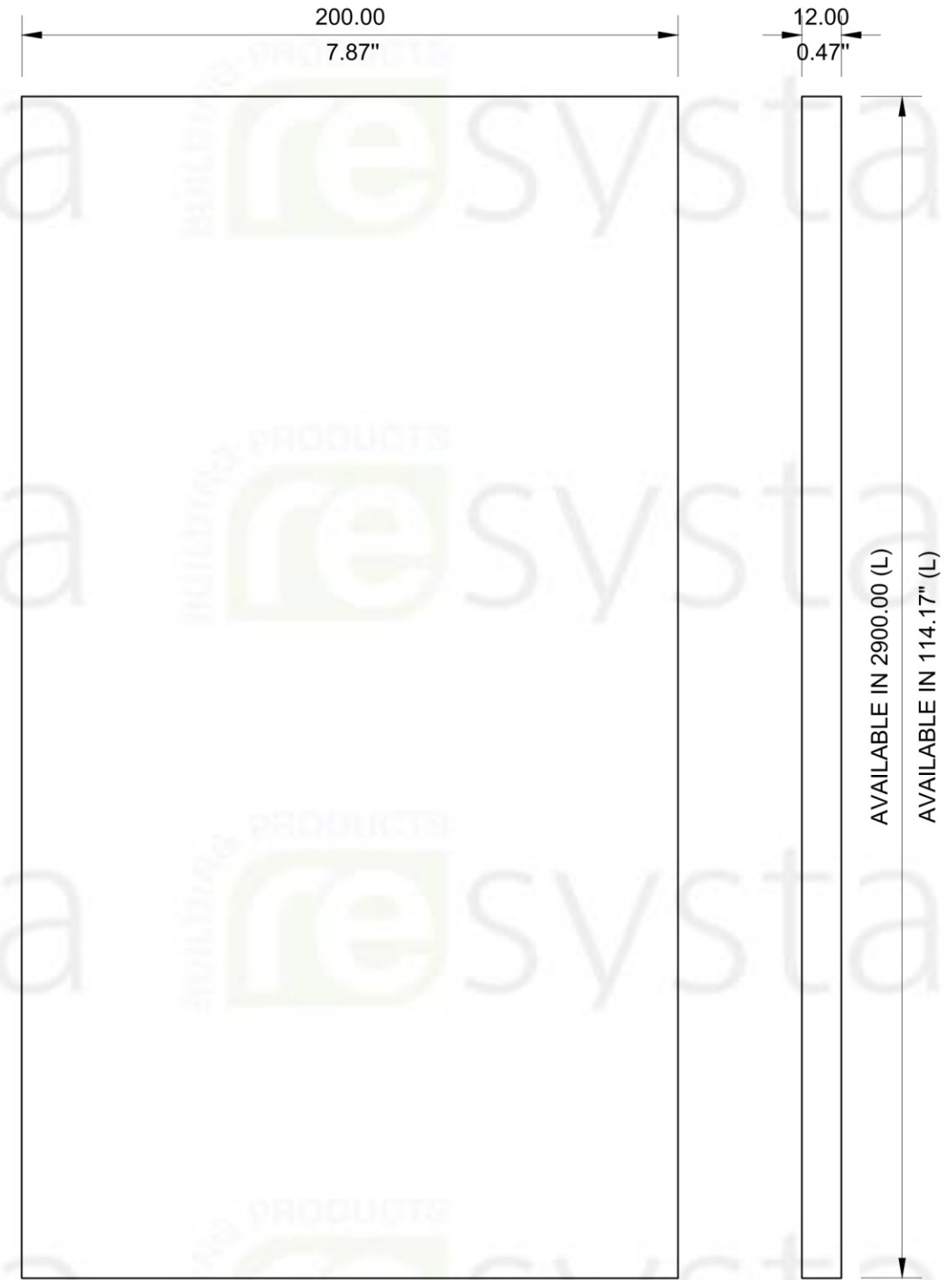
3 PLAN D-4 SCALE 1:2