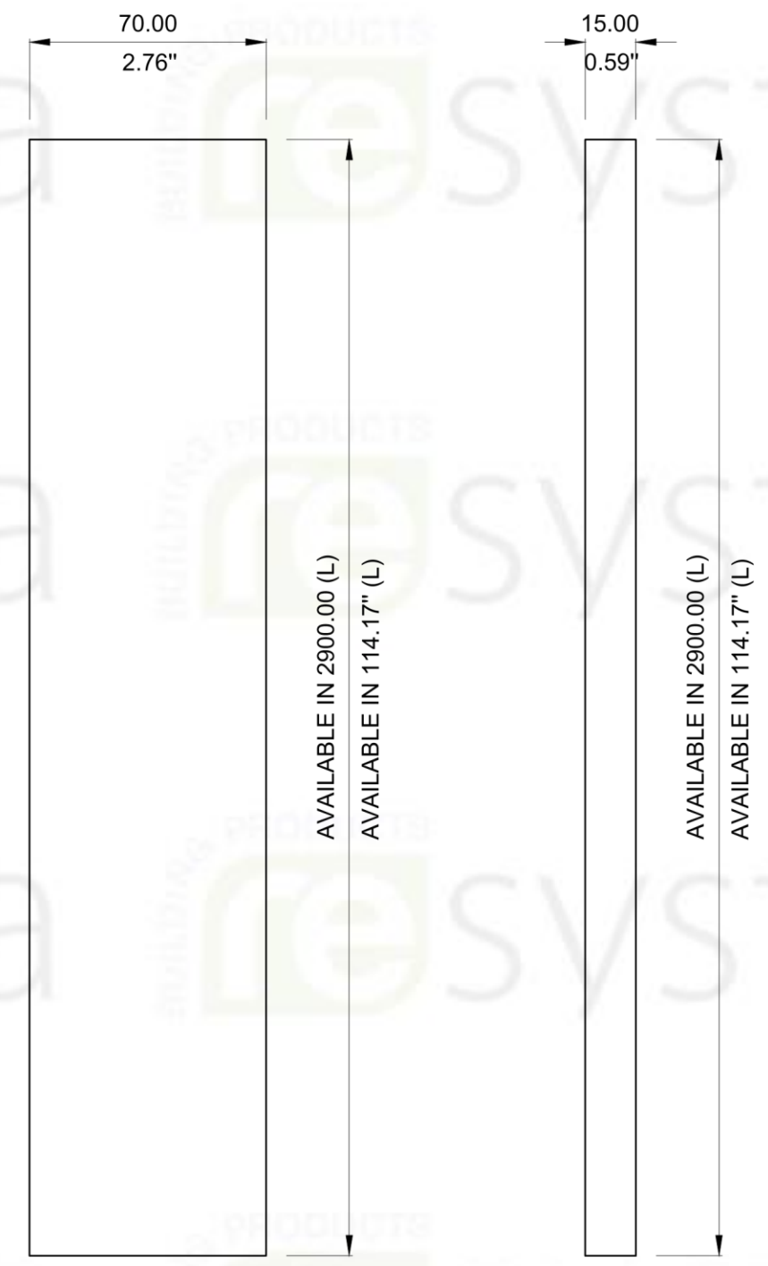
3 PLAN C-6 SCALE 1:2