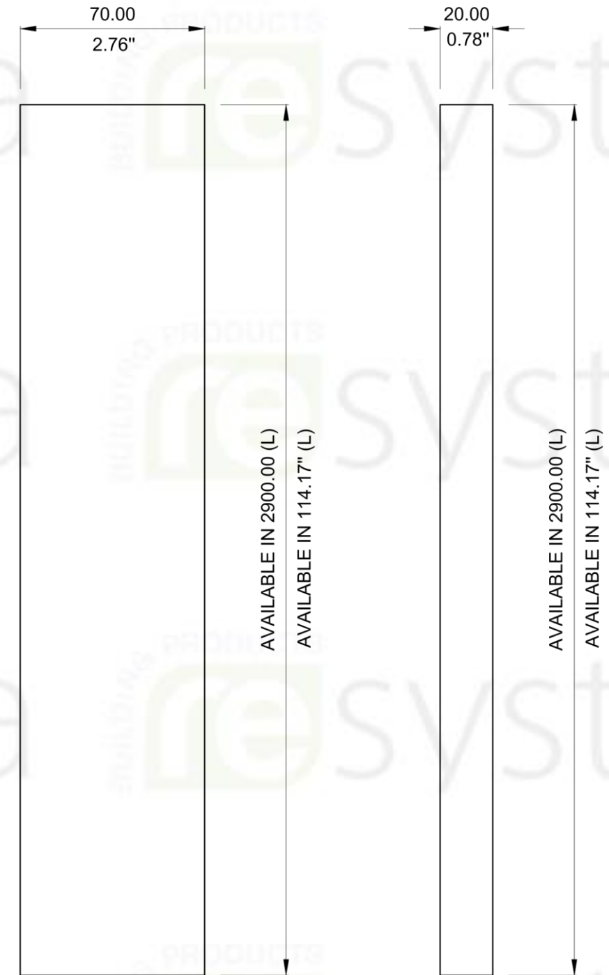
3 PLAN C-5 SCALE 1:2