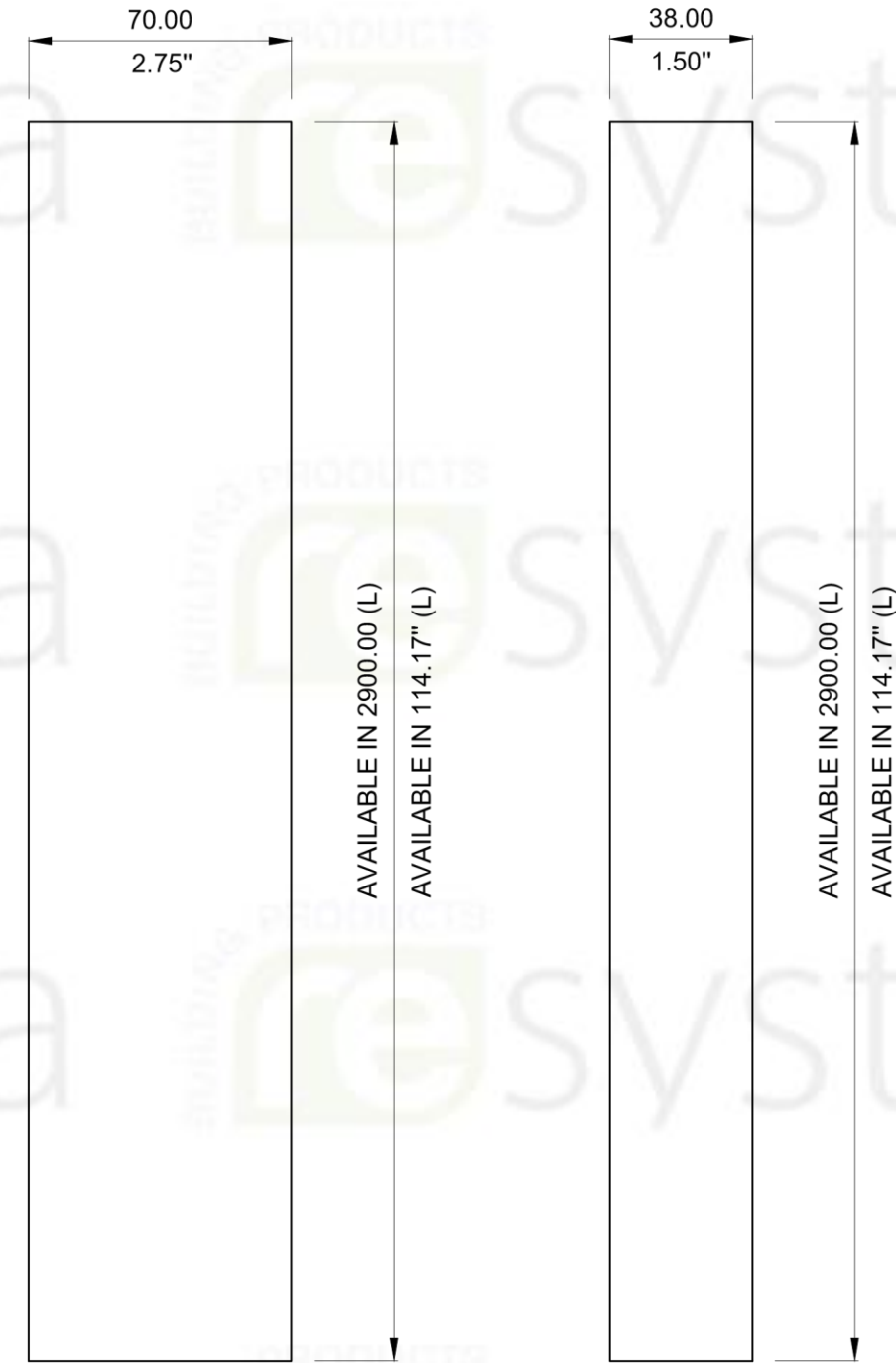
3 PLAN C-1 SCALE 1:2