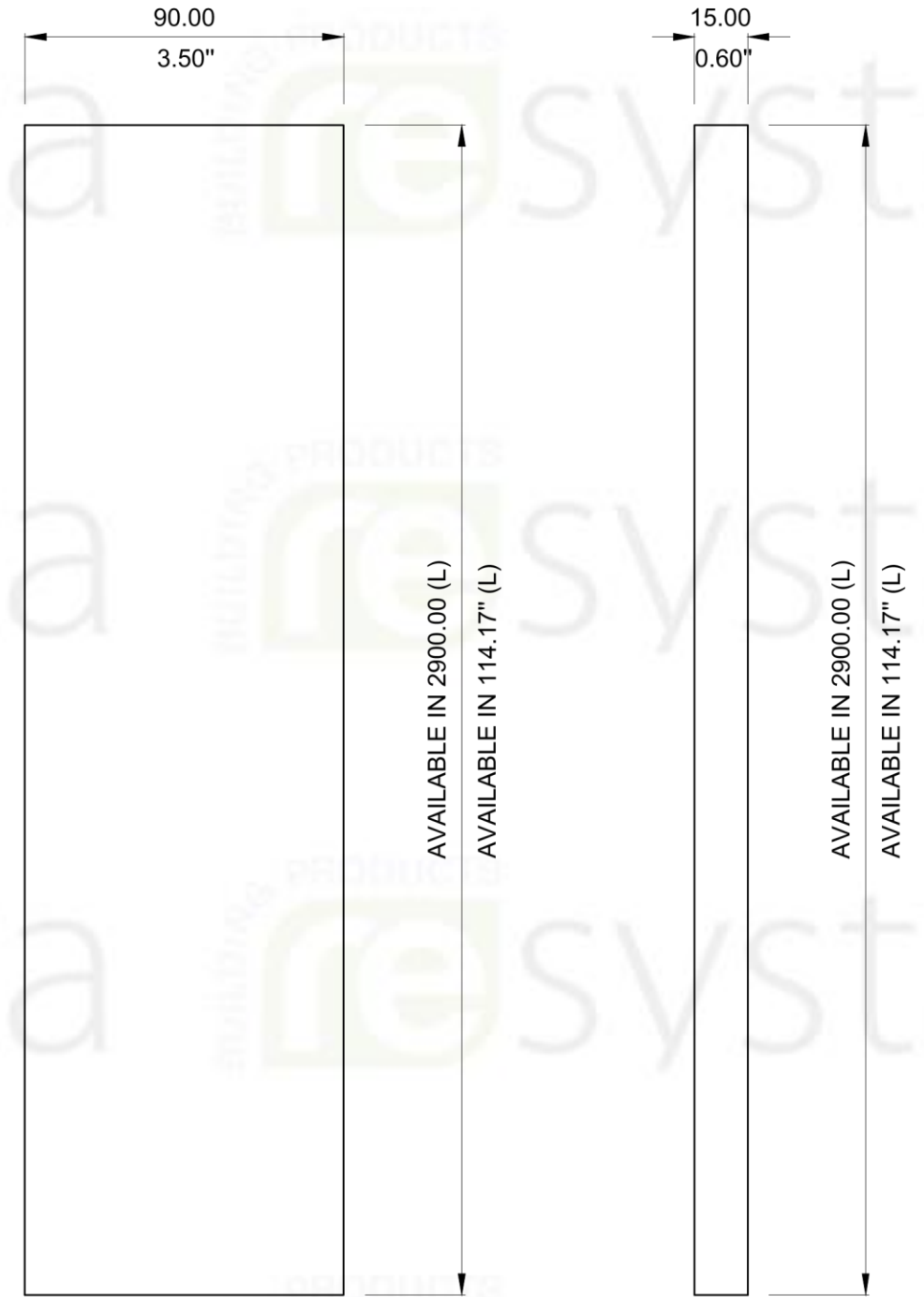
3 PLAN SCALE 1:2 4 SIDE ELEV. SCALE 1:2