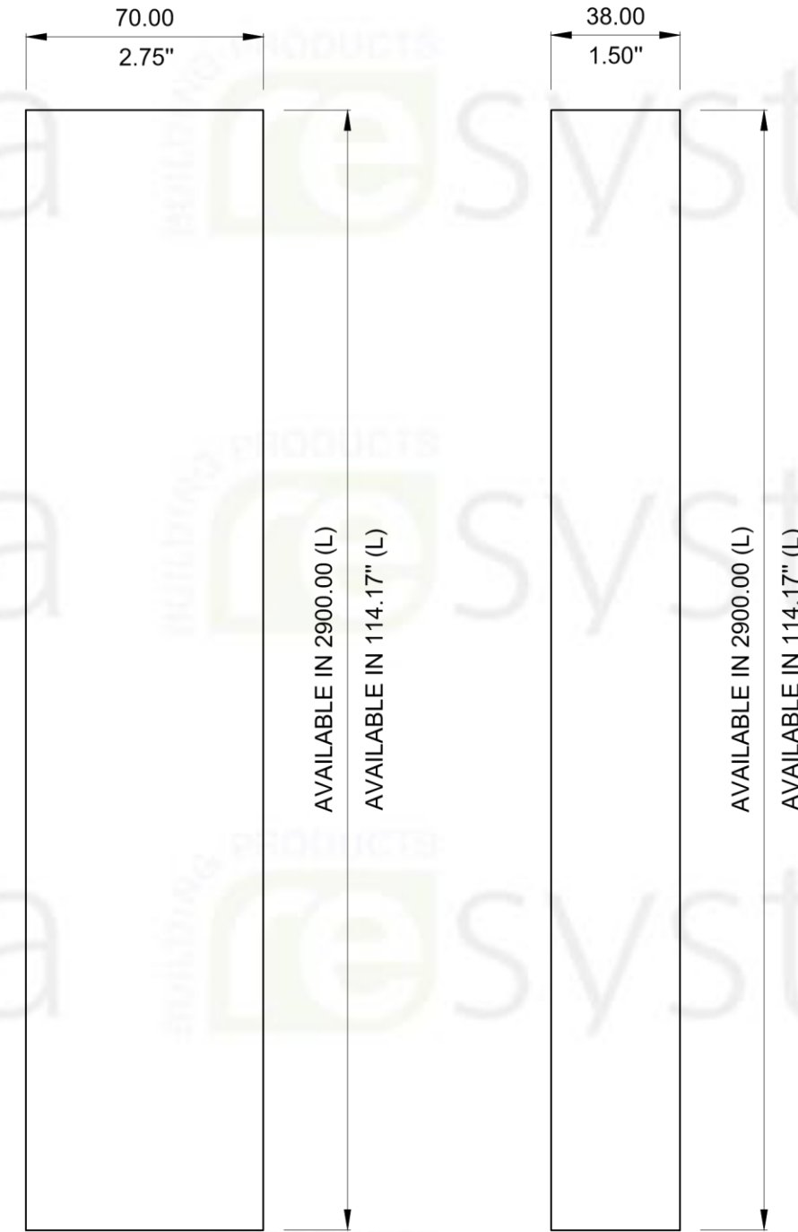
3 PLAN C-2 SCALE 1:2