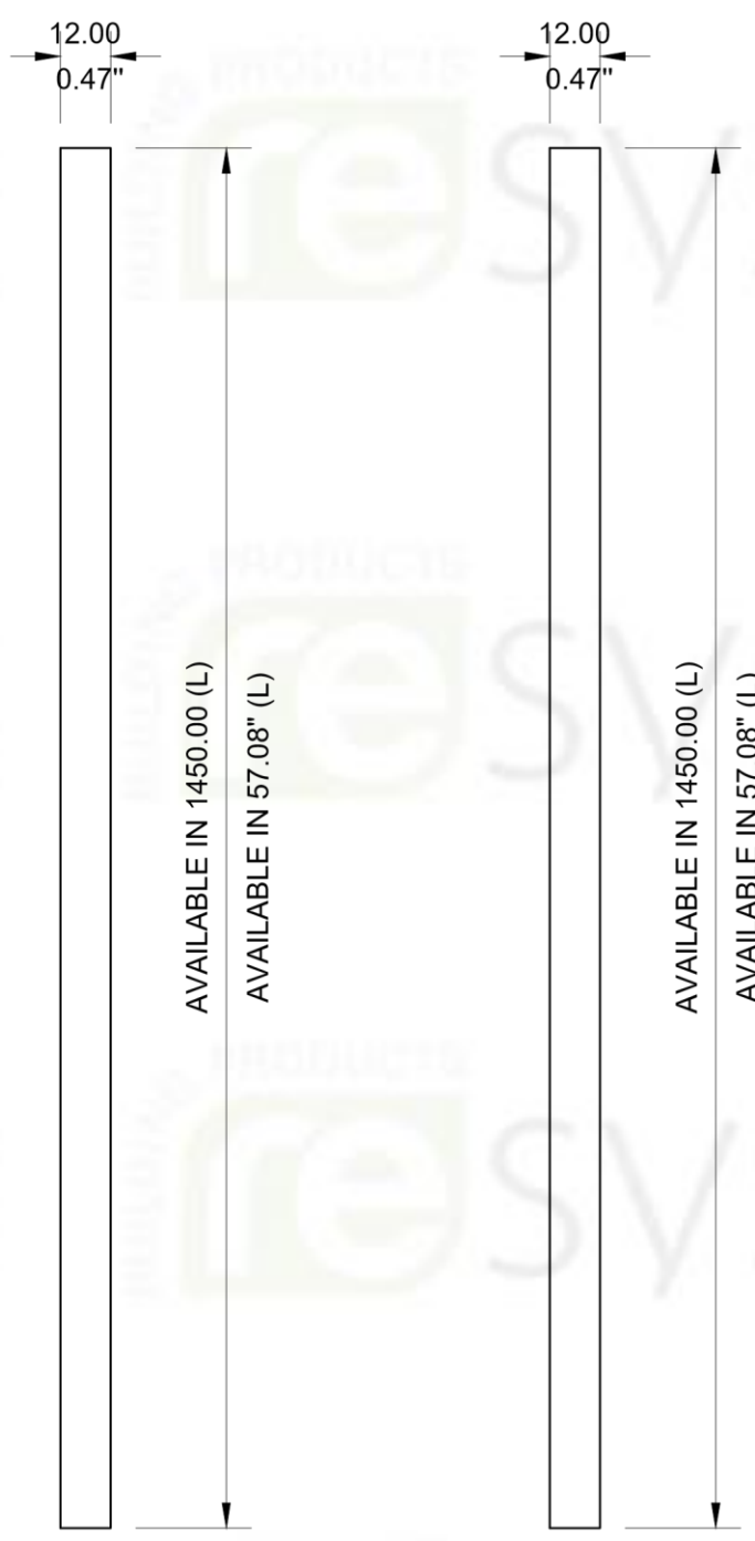
3 PLAN D-7 SCALE 1:2