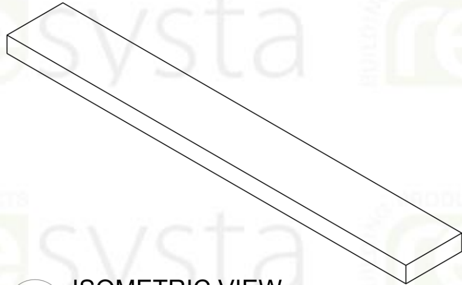
1 ISOMETRIC VIEW D-5 SCALE 1:4