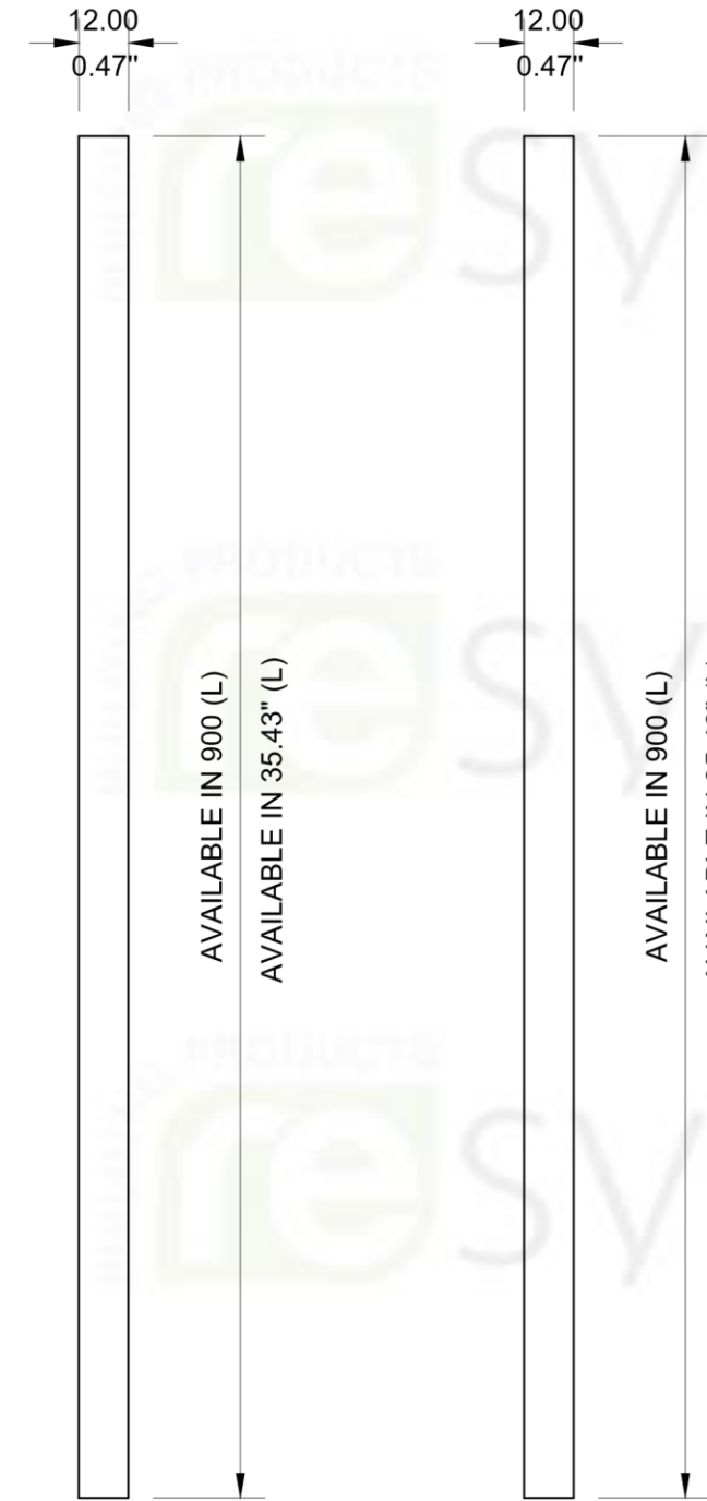
3 PLAN SCALE 1:2 4 SIDE ELEV. SCALE 1:2