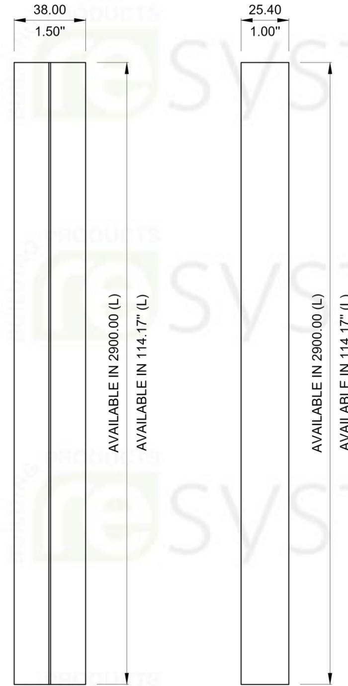
3 PLAN D-9 SCALE 1:2