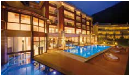
outdoor hotel facility | Meran