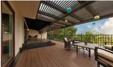
Deck | Riverside, CA.

All of its very exceptional properties make Resysta extremely resistant to weather influences like sun, rain, snow and ice, salt- and chlorine-water. Resysta does not swell, crack, splinter or rot. We provide a limited warranty up to 25 years in residential applications and up to 15 years for commercial.