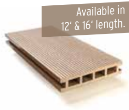
RESO10612 PLATINUM (W x H x L) 1" x 5 1/2" x 12'