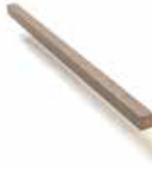
RESEGE6 EDGE STRIP (W x H x L) 1/2" x 1/2" x 6'