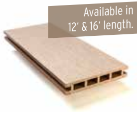
RESG010612 GOLD (W x H x L) 1" x 5 1/2" x 12'