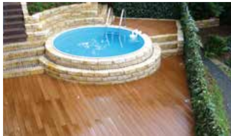
private house | Dresden