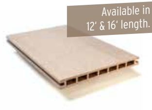
RESO10812 PLATINUM (W x H x L) 1" x 7 1/2" x 12'