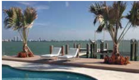
sun deck | Miami Beach