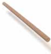
RESDOWEL3 DOWEL (Ø x L) 1/2" x 3'