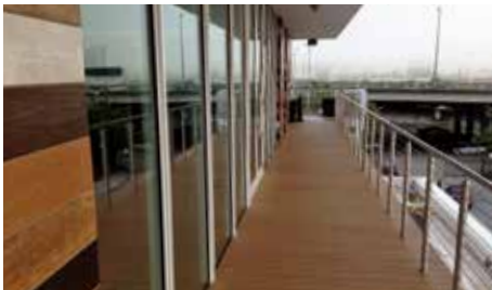
Balcony | Miami, FL.